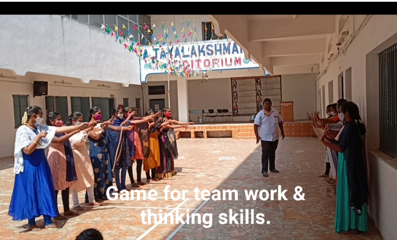
Game for team work & thinking skills.